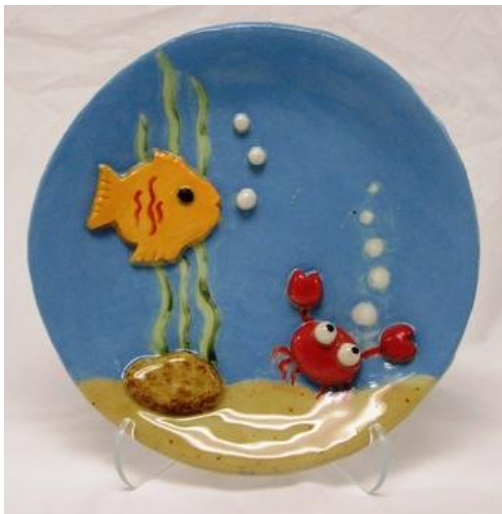
Under the Sea Plate by Karen Garnes